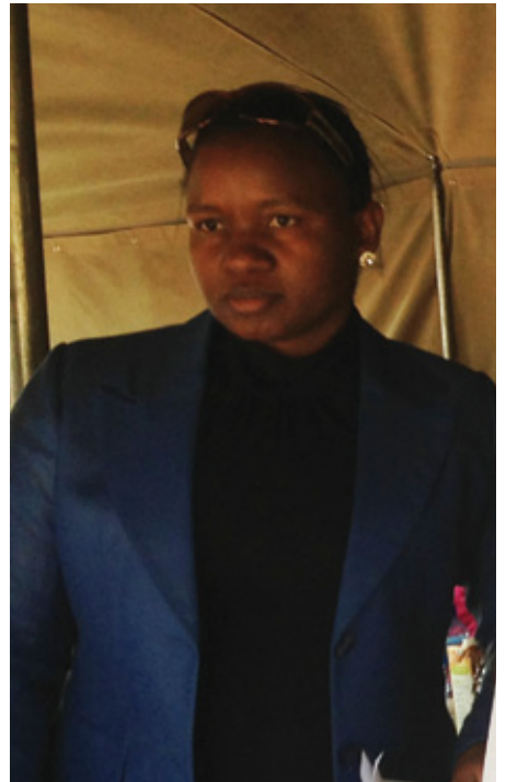
Lorwana Primary School 2013 top achievers

or a school, especially in a rural settlement, to move from 29 to 90 percent pass rate is not a small achievement by all standards. Lorwana Primary School in Good Hope Sub District has attained 90 percent pass rate in the 2013 Primary School Leaving Examinations (PSLE) from 29 percent pass rate in 2012, an improvement that earned them the pole position in Southern region. To celebrate this achievement the school, supported by the regional education office, organised a victory party for the 2013 PSLE class.